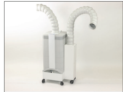
IQAir high-efficiency air purifier with FlexVac mobile source-capture kit.

In January and February 2020 IQAir arranged a number of emergency air freight shipments to Hong Kong including IQAir high-efficiency air purifiers with special FlexVac source-capture kit and OutFlow FlexAir exhaust attachments (photo). Several hundred of these specialised units with suction and exhaust ducts have been in use in over 150 Hong Kong hospitals and clinics ever since the SARS coronavirus outbreak in 2003. Hospitalised patients with COVID-19 symptoms are instructed to cough and sneeze into the flexible suction duct opening which is positioned next to the patient's head. The air containing the infectious droplet nuclei is then sucked into the system and filtered with high efficiency. Virtually microorganism-free air is expelled through the exhaust duct. The flexible duct at the top of the air purifier can be directed away from the patient, to avoid air turbulences near the patient.